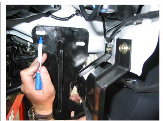
Figure 1 – Marking centre of rear slot for centre punch and drilling