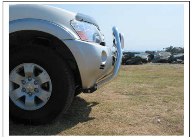
Figure 6 – 63mm Series 2 Nudge Bar shown