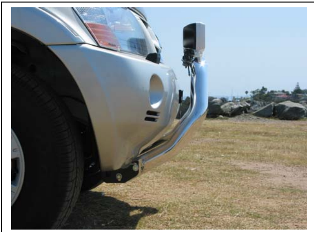
Figure 5 – 76mm Nudge Bar shown