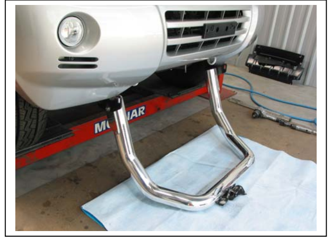
Figure 4 – Nudge Bar shown