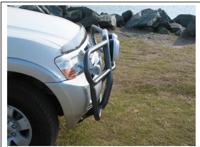
Figure 7 – Type 8 Protection Bar shown